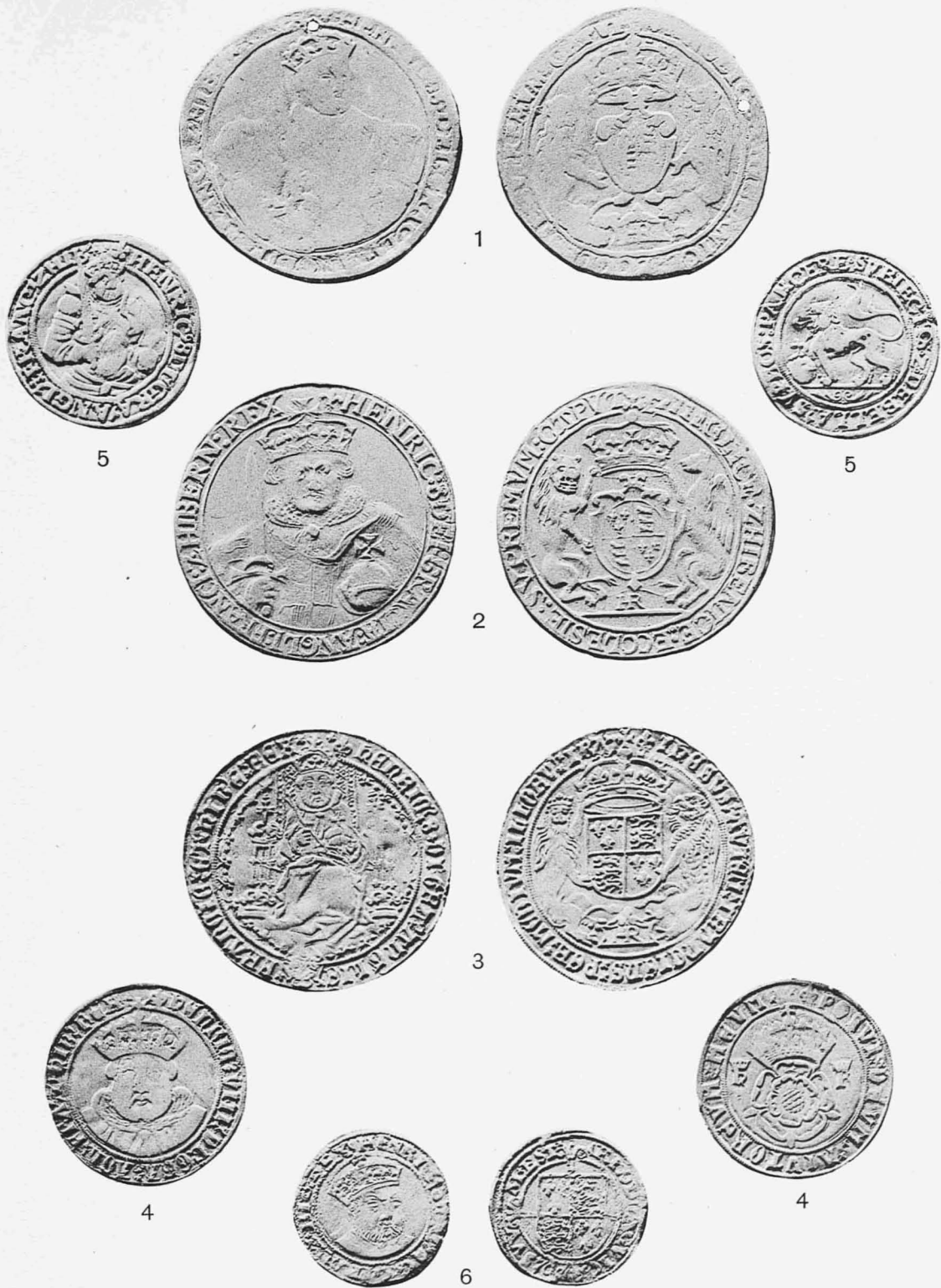
PATTERNS AND COINS OF HENRY VIII.